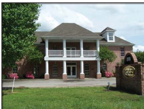
Future Home of the Gospel Broadcasting Network

Brethren, we need your help! Can you make a contribution toward the new building? Presently, we have received approximately $15,000 in funds to get us started. That leaves us with a goal of $474,000 to raise. If we could find 474 Christians and/or congregations who each would donate $1000 a piece we would own this building! If you want to contribute you can use the contribution envelope in this newsletter. Please mark your check as "building fund." If you don't have a preaddressed GBN envelope, please mail your contribution to: