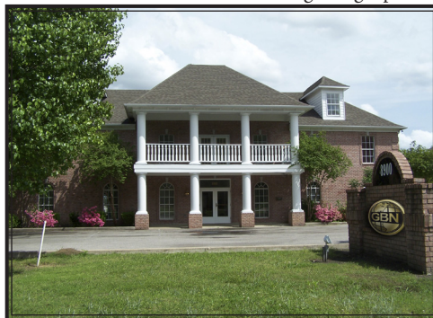
Future Home of the Gospel Broadcasting Network

As of the writing of this newsletter we have received $43,680 in contributions toward our goal of $489,000. It's a good start, but we have a long way to go. Can you help us? For the last several years we have been paying approximately $7000 per month in rent in the Chattanooga area. This rent payment will go away when we exit our present facility and move to the new one, and that money will go to furthering our efforts to preach the Word.